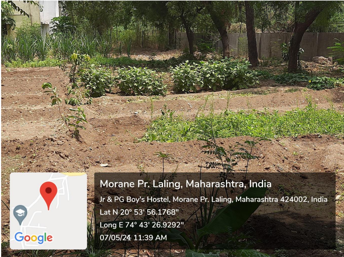
Utilization of waster water for vegetable gardening