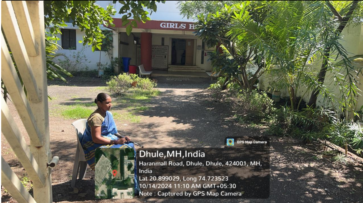
Female security guard at the entry gate of girls hostel @ACPMDC DHULE

Sakri Road, Dhule - 424001 (Maharashtra) Ph.No.: 02562 - 276317,18,19 Mob. 8686585839