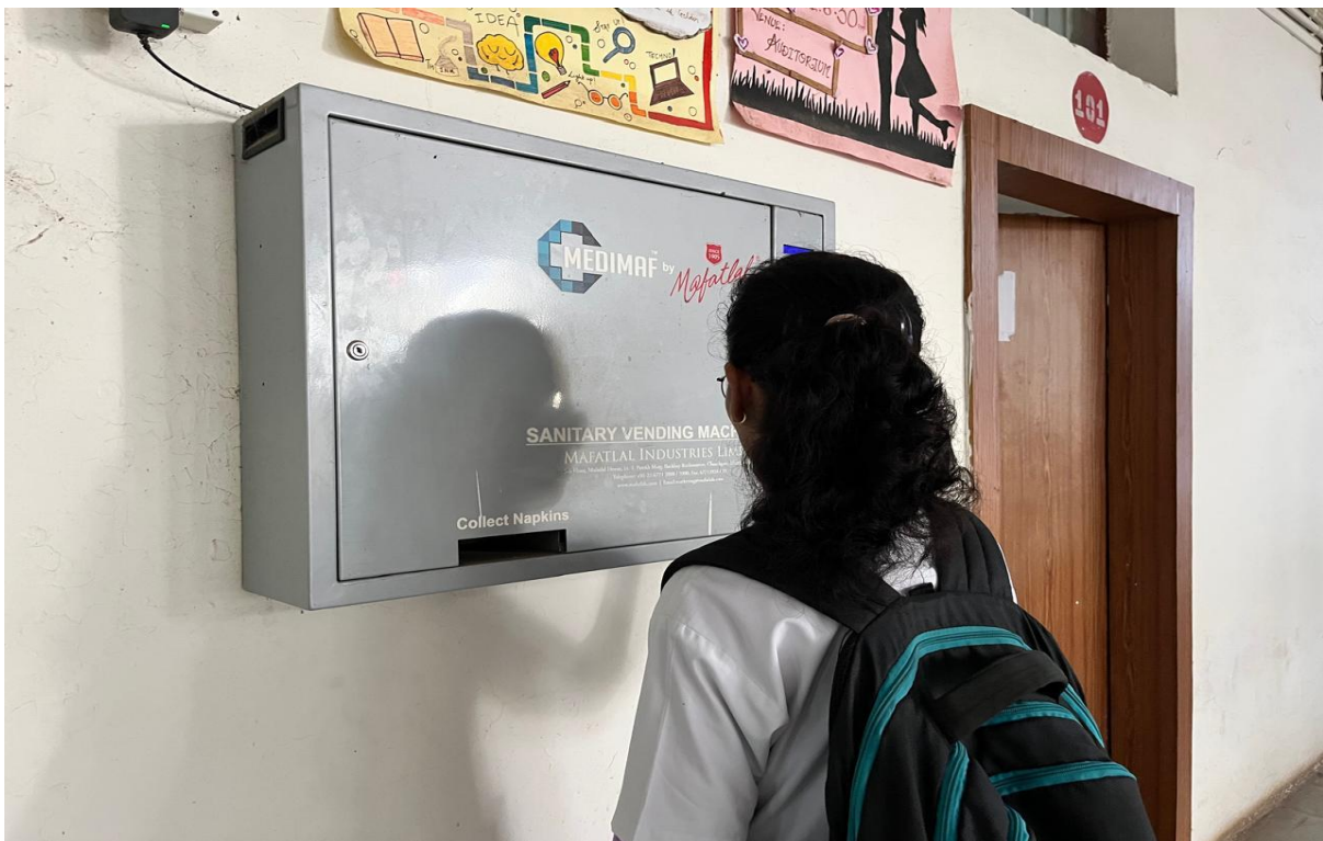
Sanitary pad vending machine at girls hostel