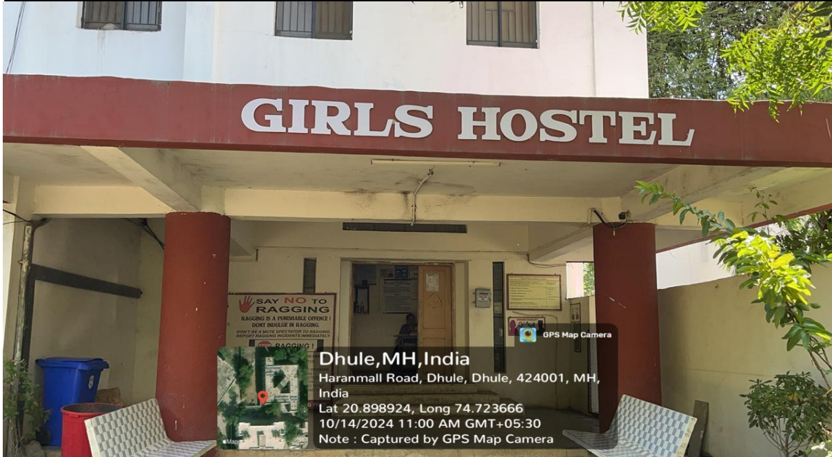
.CCTV Camera in the girls hostel @ACPMDC,DHULE.