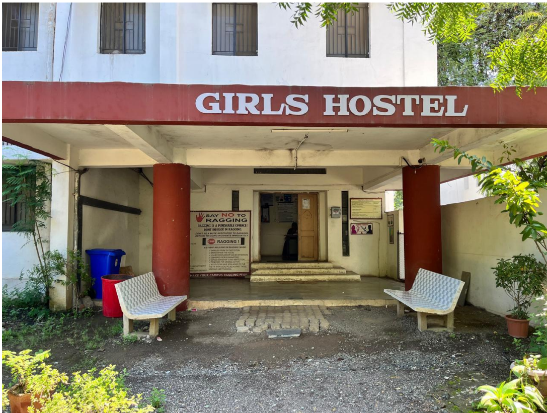
CCTV cameras at Girls hostel