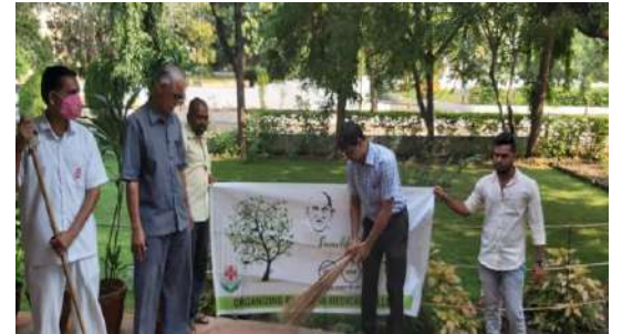
Swachha Bharat Abhiyan