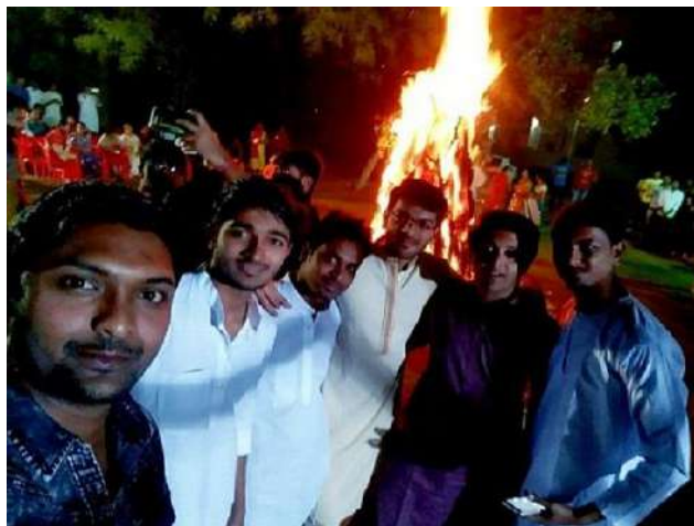
Holi Celebration 2017