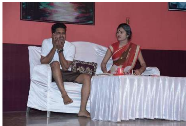
Annual Gathering "Equinox"