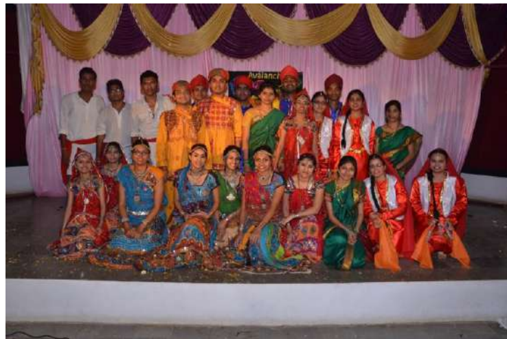
Cultural Program (Avalanche 2017)