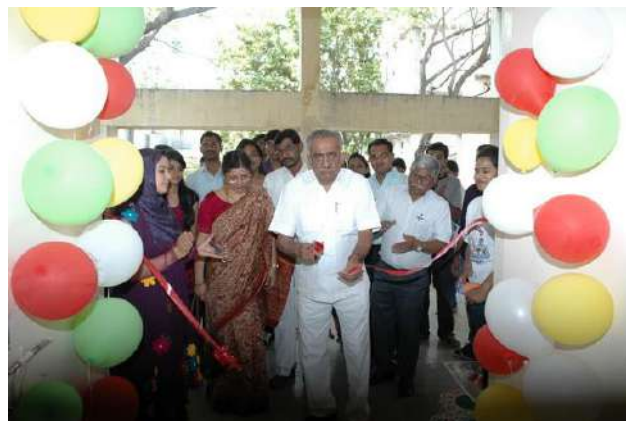
Fine Arts Exhibition